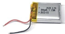
BATTERY / POWER SUPPLY

A buzzer is used in the Smart Women Safety Camera System to provide an audible alert during emergency situations. When the user presses the panic button or when a threat is detected, the ESP32 activates the buzzer. The buzzer produces a loud sound to attract attention from nearby people and warn others about the emergency. This helps in alerting people around the user and can discourage potential attackers. The buzzer is simple, low-cost, and easy to connect with the ESP32, making it an effective safety alert component in the system.