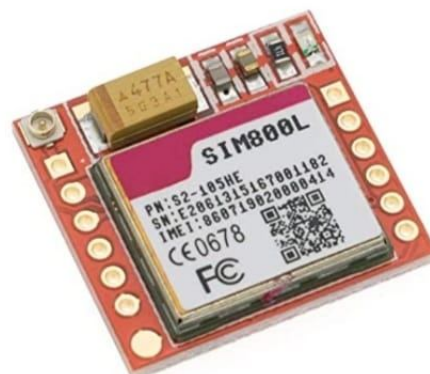
SIM800L GSM MODULE

The battery and power supply provide the required electrical energy to operate the Smart Women Safety Camera System. A rechargeable battery is used to power the ESP32-CAM, GPS module, buzzer, and other components. The power supply ensures stable voltage so that all modules work properly without interruption. Since the system is designed to be portable, a compact battery makes it easy to carry and use anywhere. A proper power management system also helps in longer battery life and reliable operation during emergency situations.